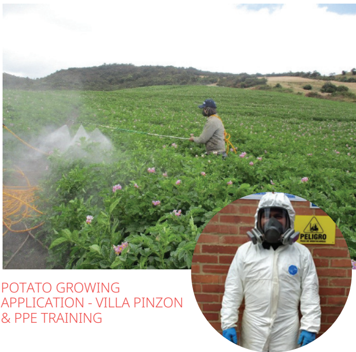
POTATO GROWING APPLICATION - VILLA PINZON & PPE TRAINING

UPL Colombia proudly continues with UPL stewardship commitment by carrying out its strong advocacy for the safe use and proper management of agrochemicals in all its regions of operations. Ensuring that UPL is a committed partner in ensuring sustainable and safe agriculture for all.