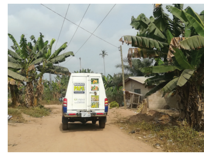
OUR AUTONOMOUS TRAINING MOBILE UNIT OF NGUSO PAPA IN GHANA, ON THE ROAD TO TRAIN.

For West and Central Africa regions, our stewardship commitment translates to the existence of several fully autonomous mobile training units. These mobile units, along with dedicated teams, help us reach as close as possible to producers, applicators/technicians, and offer them our free training, adapted to their needs. These activities are being conducted under the Applique Bien /Nguso papa program.